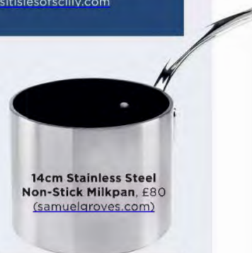
14cm Stainless Steel Non-Stick Milkpan, £80 samuelgroves.com