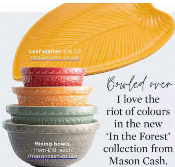
Leaf platter, £16.50 masoncash.co.uk