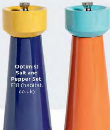
Optimist Salt and Pepper Set, £18 ( habitat.co.uk )

These salt and pepper pots from Habitat bring a jaunty shot of colour to the table and are a pleasure to use.