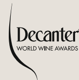
Preferred one colour