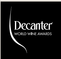
Reversed one colour