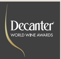
On a dark background